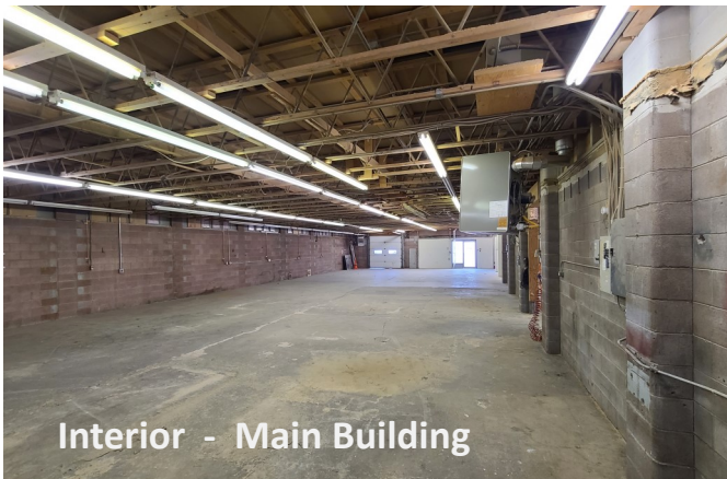
Interior - Main Building