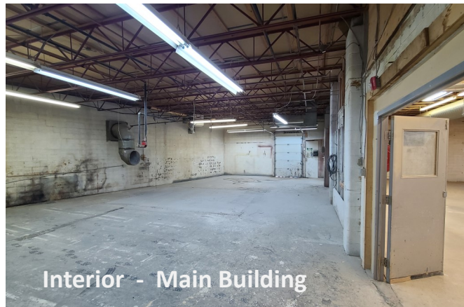
Interior - Main Building