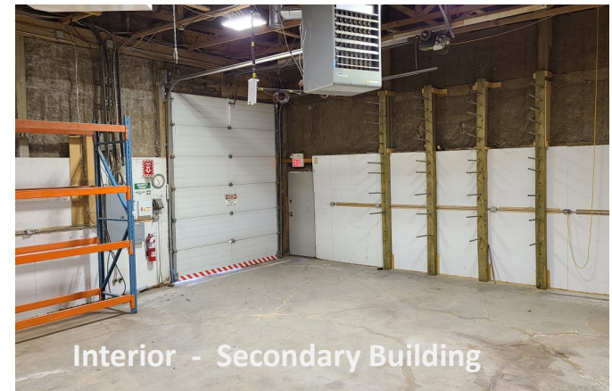
Interior - Secondary Building